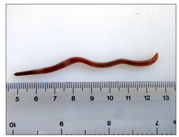
Figure 1. D. alpina earthworm; photos of the same individual – a mature specimen